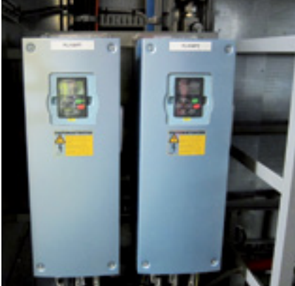
Drives for cooling water pumps