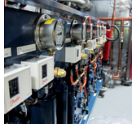
Also the refrigeration system is controlled by Danfoss components