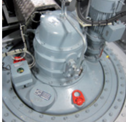
One of the Schottel propellers