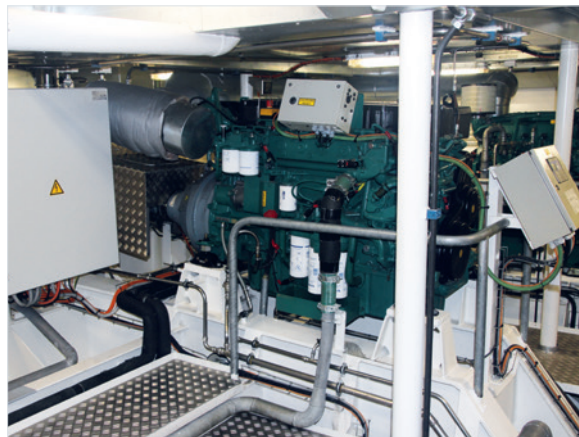
Volvo Penta marine diesel engine.

The double-ended ferry is powered by two identical Volvo Penta marine diesel engines with Schottel azimuth thrusters at each end of the vessel; each with its own engine room. There is full redundancy of the diesel propulsion.