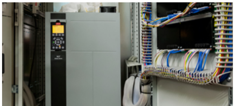
Danfoss Drives VLT® FC102 250 kW drive mounted inside its cubicle.

"Tight spaces are a challenge," observes Leone, "and so was the request for the production of electrical control panels with type 4a segregation. Each functional element inside the panel must be separate from the others."