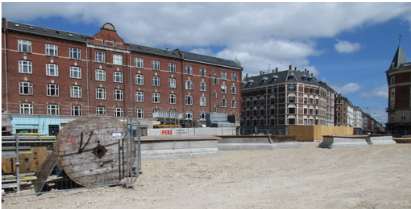
Copenhagen, work in progress