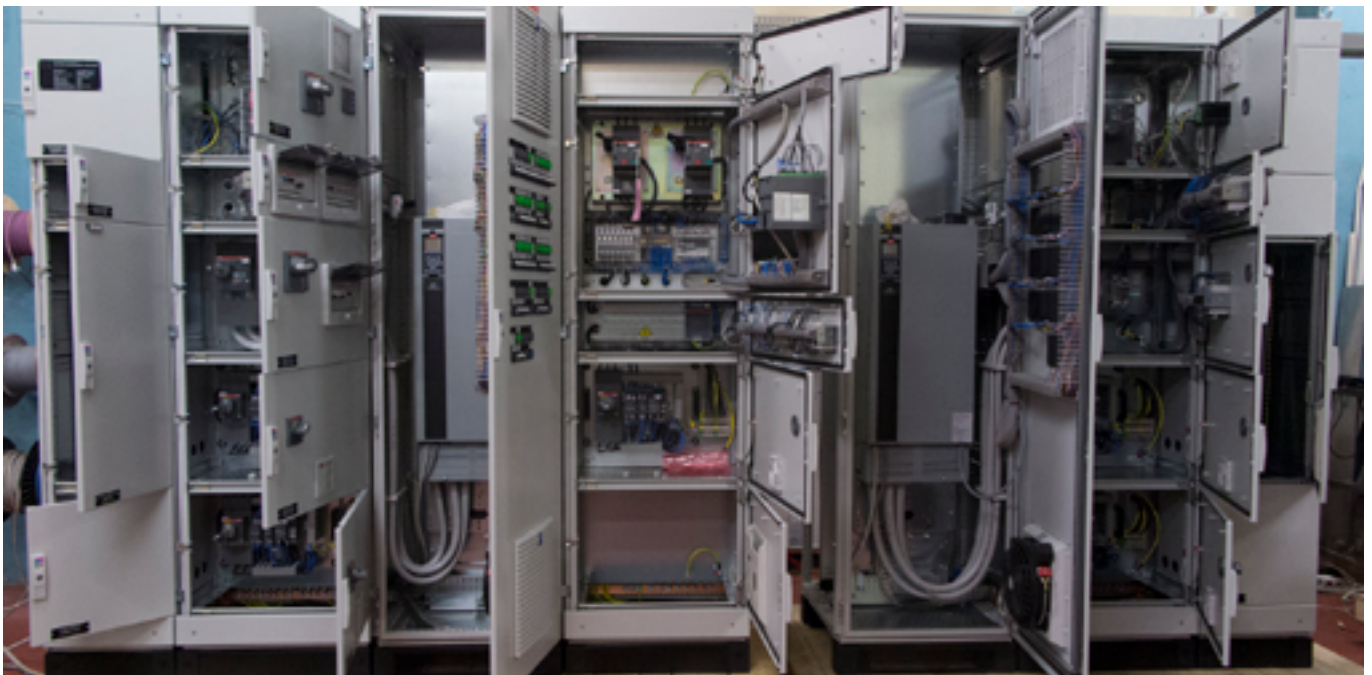
Panels for the station named "FBA" in Frederiksberg Allé, just tested in the H.S. Progetti Production Department and waiting to be packed.

In more general terms, it is worth noting the following features: the Fire Mode function, which ensures the rotation of the motor for as long as possible in the event of a fire; and the Smart Logic Controller, i.e. an integrated mini PLC where up to 20 functional blocks can be created, making the use of the PLC superfluous in some cases. The MyDrive Connect option, enables the control and management of all the features by means of a proprietary app as an alternative to the graphic display and USB connection, ensuring greater flexibility and operational versatility."