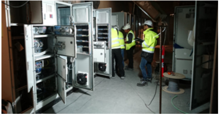
Panels from the station named "FBA" already placed on the technical floor and photographed during the tests carried out jointly by Systemair and H.S. Progetti.