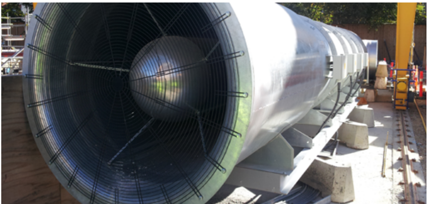
Systemair 4 x 75 kW four-phase fan.

"The equipment in use," states Valente , "is for the excavation phase with the TBM, the mechanical mole. As soon as the spaces between the future stations had been opened, 117 induction fans in the Systemair series IV with low-profile configuration were installed"