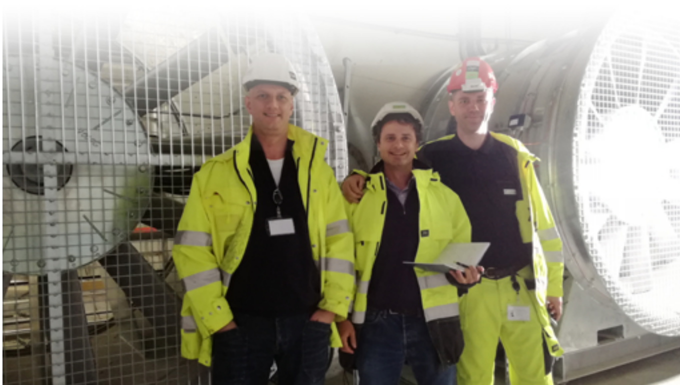
Ventilation chamber inspection at the "EHP" station with Systemair personnel.

H.S. Progetti Srl, based in Ferriera di Buttigliera Alta (Turin), is specialized in the design and construction of special automatic machines for production, construction of control and test benches, supply and development of software for PLC, supervision software and service.