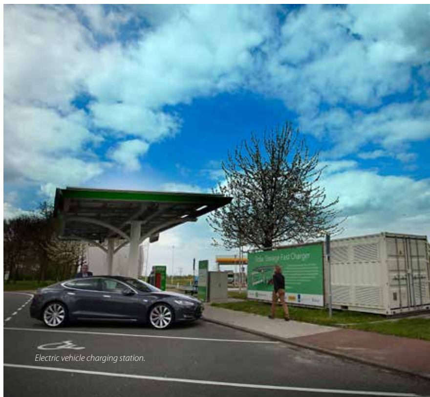
Electric vehicle charging station.

(grid operator) and MisterGreen (EV lease) have evaluated this pilot to be a success: peak loads decreased, maximum flexibility in offering variable price rates was attained, and the charging station itself became even more sustainable.