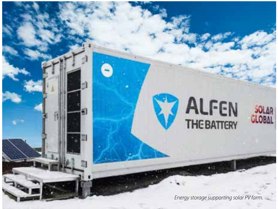
Energy storage supporting solar PV farm.

Solar Global develops and services solar photovoltaic (PV) farms and rooftop PV installations, and currently has some 100 MW capacity under service. As Solar Global wants to play an important role at the forefront of the energy transition, it is investing in an innovative energy storage solution that initially will be used for energy trading. As the local market further develops, the system is also ready for other applications, such as providing grid stability services.