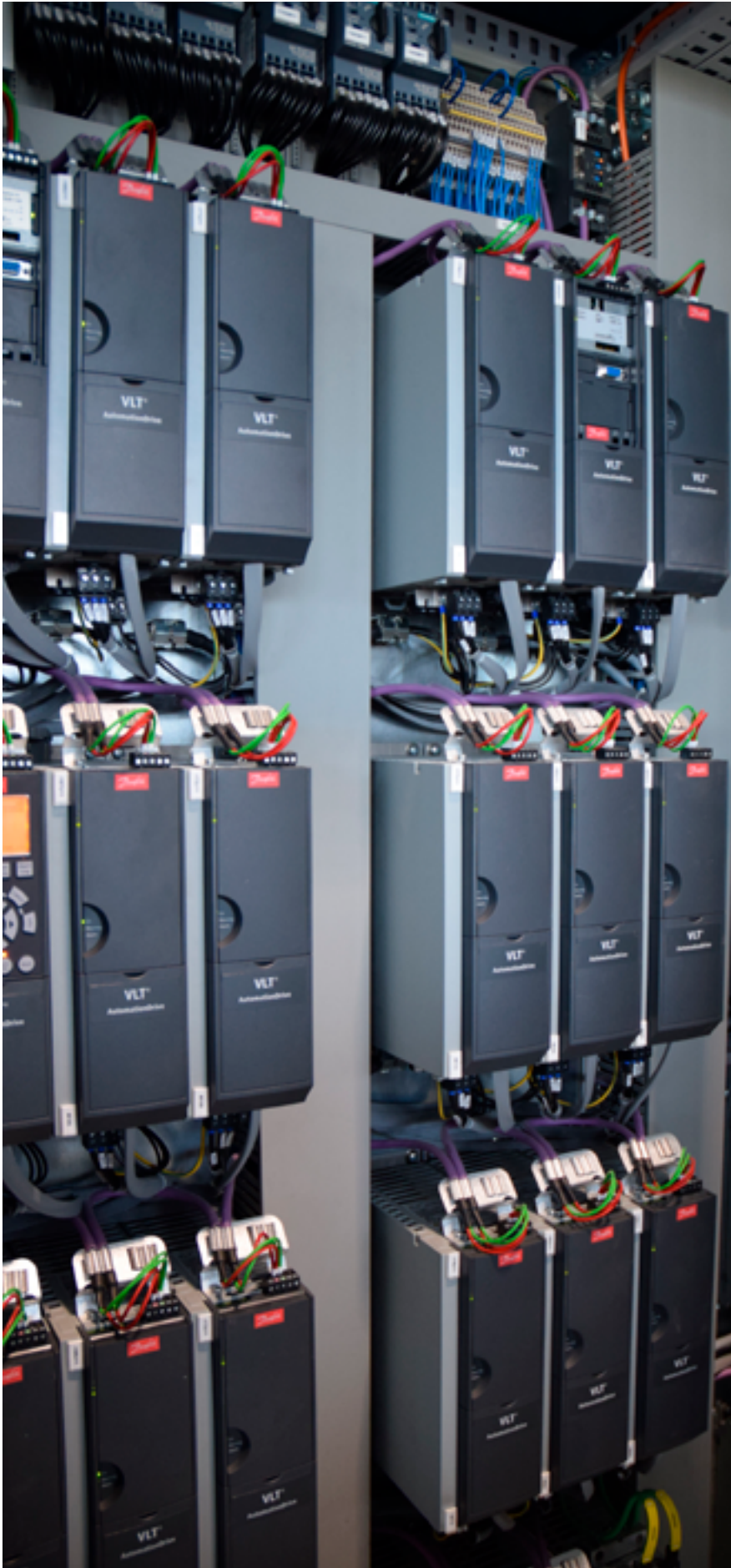
The Danfoss VLT® AutomationDrives, with suitable dimensions for the requirements of the transporter type installed on the cabinet, are designed to control the variable speed of all permanent magnet synchronous reluctance motors and made to increase flexibility and optimize the process control for any industrial machine or production line.

“The sensorless system” – observed Frosi – “guarantees services that are equivalent, if not superior, to those obtained by managing flows in a more conventional manner, using sensors and photocells. There is added value in the ability to guarantee maximum efficiency and continuity for the services provided. Indeed, you no longer need to deal with sensors and photocells that require maintenance and, if you accidentally tamper with or decalibrate them, you can significantly damage the process and create inefficiency. Especially on complex lines, for example, in the bottling industry.”