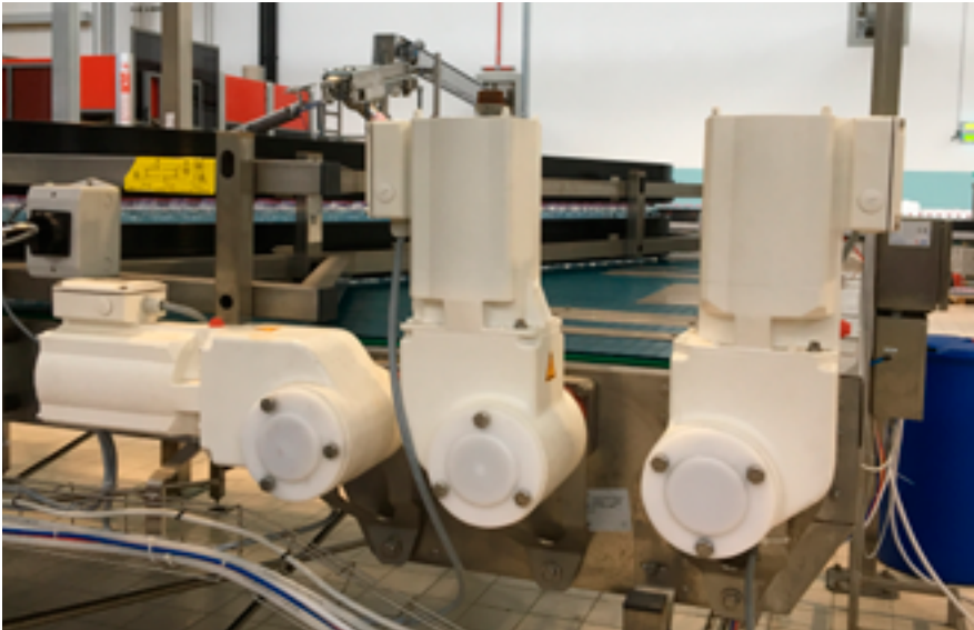
View of the Danfoss VLT® One Gear Drives, installed at the end of the line. IP 69K protection level fulfills requirements for the best hygiene and cleansing design.

“This process,” concluded Forsi, “is in line with the specifics of Industry 4.0 and it can be managed and controlled via tablet and PC at all phases, for which progressive controls are planned so that any bottle that does not conform can be detected and removed without interrupting the cycle and, therefore, productivity.”