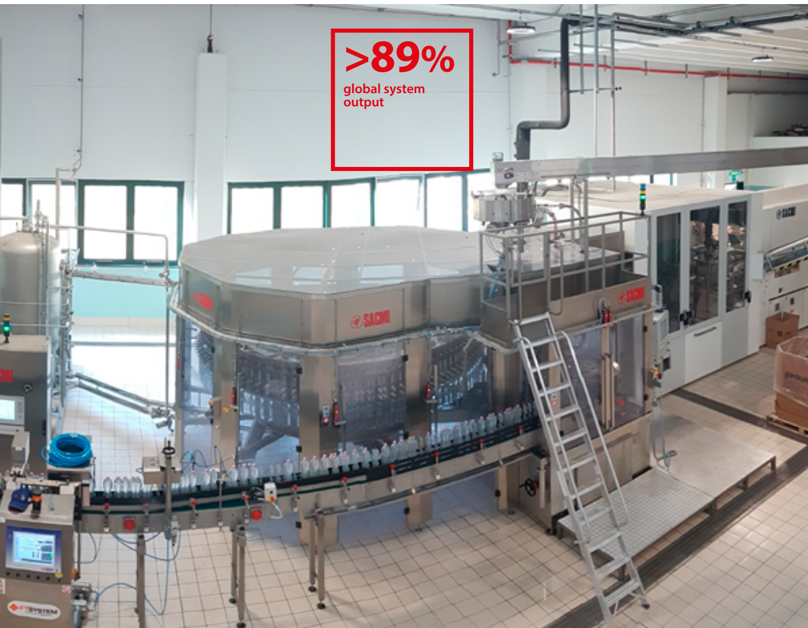
Bottling line for the production of 1.5 L bottles