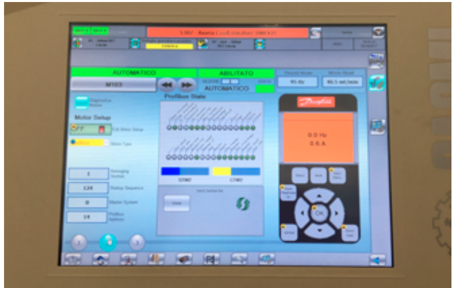
HMI for transporter automation where Sacmi replicated the LCP programming of the frequency converters to potentially modify the parameters of each device without needing to open the electrical cabinet.

The evolved automation system that Sacmi Filling was able to implement, thanks to the Danfoss VLT® FlexConcept drive system, not only avoided the direct use of sensors and related wiring, but provided even more significant added value with respect to competitiveness.