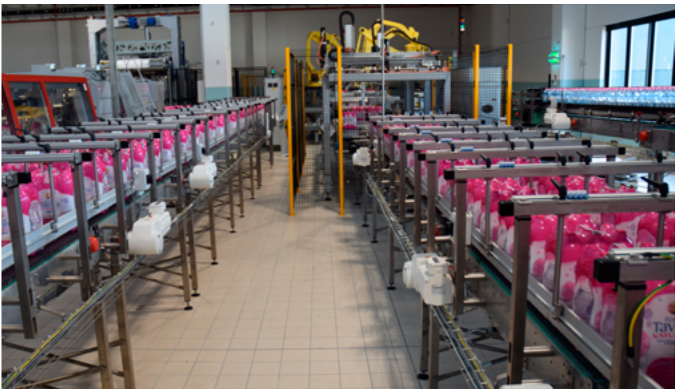
Parallel bottling lines

As previously highlighted, each line is equipped with 40 VLT® OneGearDrives positioned along the transport system. Likewise, these correspond to the Danfoss VLT® AutomationDrives, which are suitably positioned in the automation cabinet. They were designed for variable speed control of all asynchronous motors and permanent magnet motors, both with closed and open loop (the latter have been chosen and adopted by Sacmi Filling specifically for this application), and to increase the flexibility and