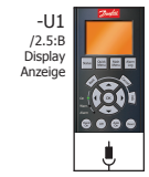
-U1 /2.5:B Display Anzeige