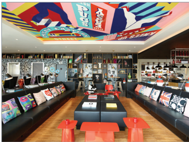
The dynamic and strikingly urban lobby area protected with SEM-SAFE® high-pressure water mist system

The SEM-SAFE® high-pressure water mist system offers fast and effective control and suppression of a fire. It offers a quick return to operation in the event of a fire, with minimal post-fire damage and small amounts of water used during operation. The installation by Fireworks is made easy due to the small bore stainless steel grade 316 pipe, which offers superior life over the other pipe materials offered.