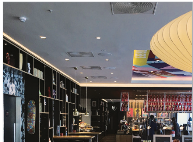
The SEM-SAFE® high-pressure water mist nozzles fits perfectly with the modern interior of CitizenM Shoreditch Hotel

"When looking for fire suppression for the new Citizen M Hotel in Shoreditch, following extensive market research, the Danfoss Semco SEM-SAFE® water mist system was chosen for a number of reasons; the quality of the expertise and installation offered from the UK partner Fireworks Fire Protection Ltd, good coverage from nozzles meaning less nozzles to install, aesthetically pleasing nozzles and only small pumps / tanks required."