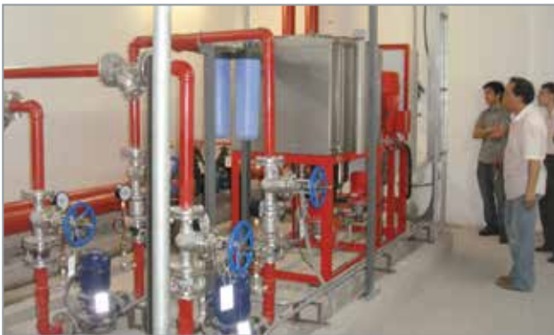
SEM-SAFE® pump unit installed in the project site

In 2009 all fire tests necessary were passed successfully, proving the reliability of the SEM-SAFE® system. The SEM-SAFE® high-pressure water mist acts efficiently in controlling the fire, with minimum water consumption and close to no water damage. In order to ensure the safe evacuation of the people from the train, in case of a fire, micro nozzles were installed at every door opening in the station. Upon activation, dense water is rapidly discharged, forming a "water curtain", which will keep the smoke inside the train. It offers control over the heat, smoke and toxic gas, thus ensuring safe evacuation of people and easy access for the fire fighting crew. The system will prevent fire from spreading from the train to the platform, while lowering the temperature and scrubbing the smoke.