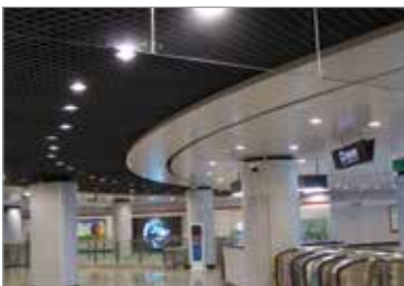
Access area to the metro protected with SEM-SAFE®