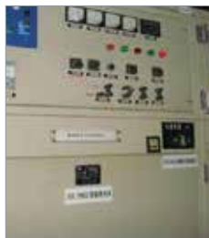
Key operation equipment protected with SEM-SAFE®