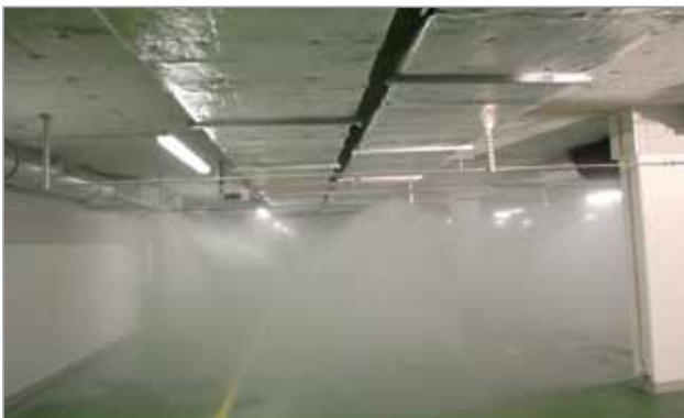
Minimal water consumption

The SEM-SAFE® high-pressure water mist nozzles are tested and accepted by VdS, an internationally recognized approval authority. Also, SEM-SAFE® successfully passed the fire criteria set by the local BM OKF (National Directorate General for Disaster Management-Fire Protection). During the public certification, a full scale test of the SEM-SAFE® high-pressure water mist system took place in the car park. All technical requirements were passed successfully.