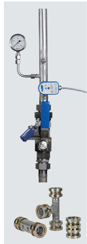
Press fittings and section valve for the accommodation area.